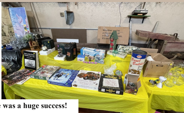
Our Yard Sale was a huge success!